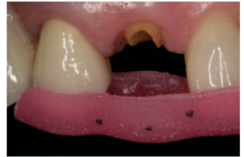
Fig. 6. Preoperative labial view of a failing maxillary right cuspid with the rigid stent.

Patient examinations and measurements were performed by each investigator in his office at 2, 4, and 6 weeks, 3, 4, 6, and 12 months, and the following points were recorded: