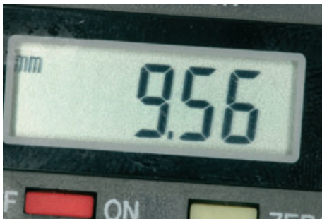
Fig. 3. Digital screen of the electronic caliper showing actual measurement to second tenth of a millimeter.