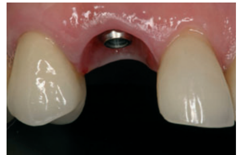
Fig. 9. Clinical view of peri-implant tissues prior to final restoration delivery.