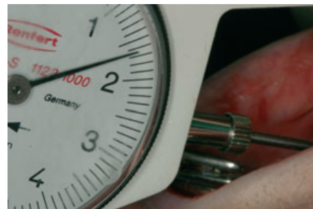
Fig. 5. Detailed view of measurement of periodontium with the caliper.