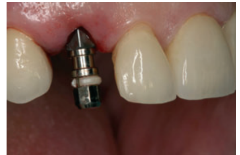
Fig. 7. TE Straumann® implant after insertion in ideal position for direct screw retention of provisional restoration.