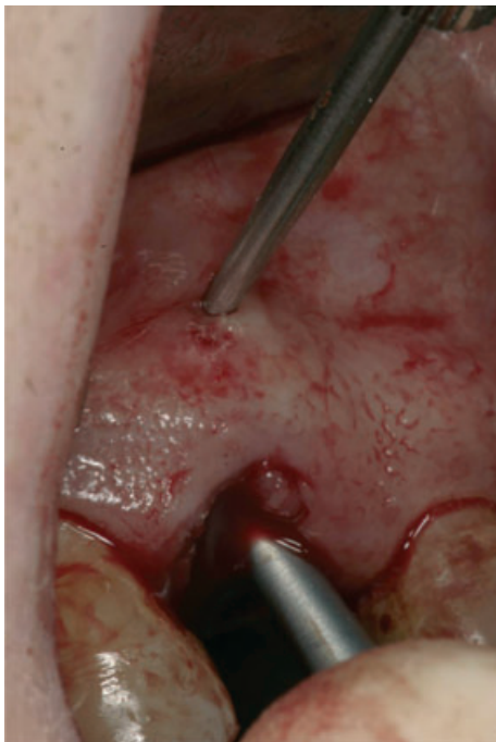
Fig. 4. Measurement of total thickness of the periodontium (biotype) with an analogical gauge, at a point 5 mm from buccal gingival margin.

the osseous wall and no soft tissue graft was attempted either.