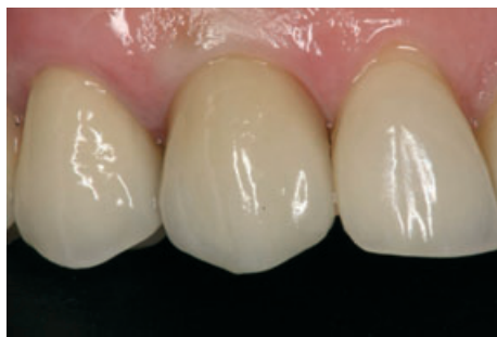
Fig. 10. Final restoration in place (metal-ceramic, direct screw-retained).