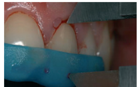
Fig. 2. Measurement with electronic caliper with rigid stent before tooth extraction.