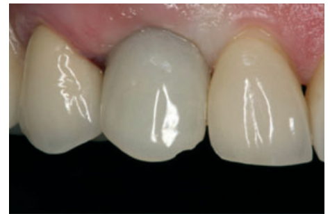
Fig. 8. Immediate provisional restoration after flapless procedure (trimodal approach).